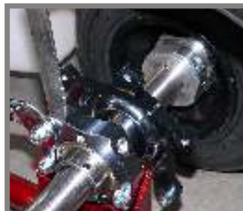
Cnc sprocket carrier