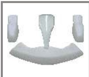
New homologation 2005 bodyworks