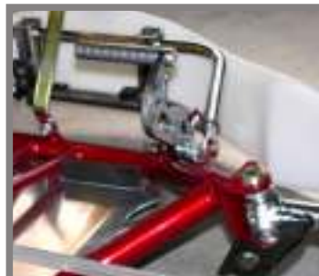
Option: billet alloy pedals