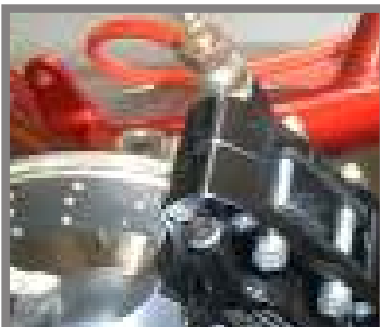
Self adjusting brake system