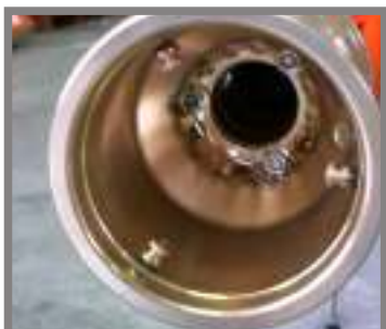
Magnesium wheels 50mm hole

Tyres, engine mount and bodywork are excluded.