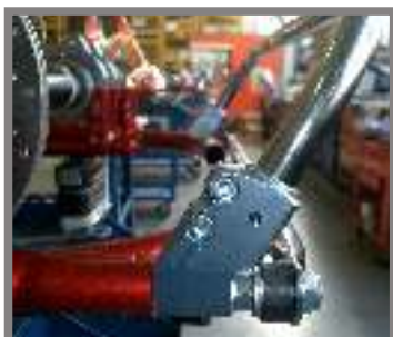
Cnc rear bumper support

Tyres, engine mount and bodywork are excluded.