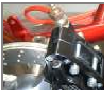
Self adjusting brake system