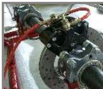
Self adjusting brake system