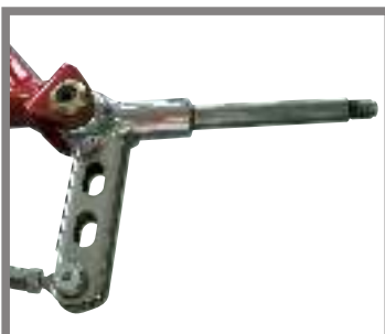
Motorsport stub axle