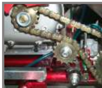
Complete chain & belt tensioner