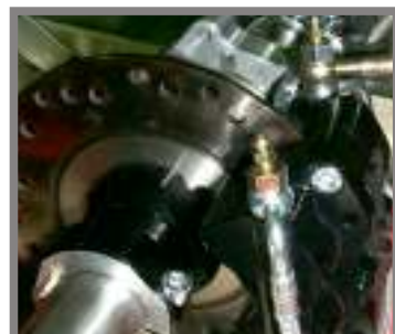
Self adjusting brake system