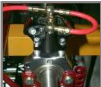
Self adjusting radial fitting