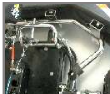
High impact energy polymer bumper