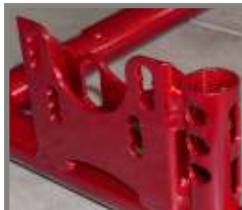
Adjustable bearing holder