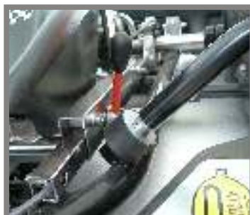
Longitudinally adjustable seat