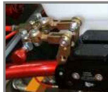
Brake bias adjuster