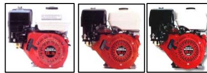
Honda GX200 Honda GX270 Honda GX390