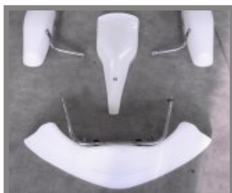
New homologation 2005 bodyworks