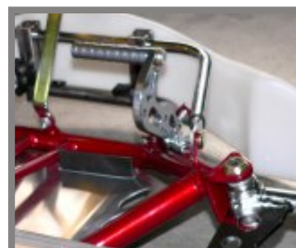
Adjustable bearing holders